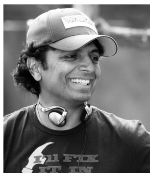
M. NIGHT SHYAMALAN